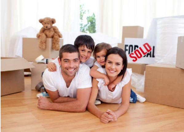
MANUFACTURED HOME PERMIT

A useful guide to our permit process for manufactured homes in Cherokee County